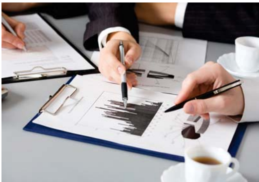
Old Reporting and Visualization